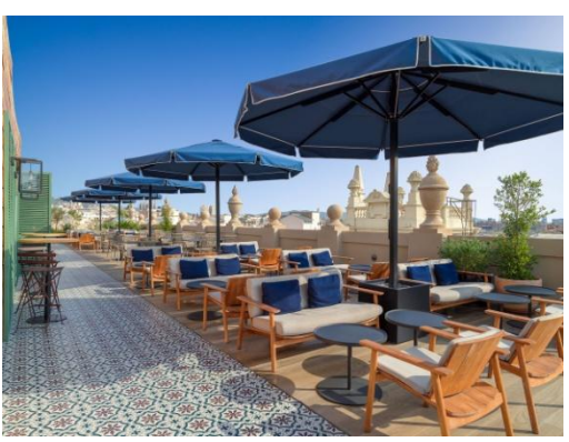
TERRASSA DEL GÒTIC

Terrassa del Gòtic (seasonal): An impressive terrace on the top floor with panoramic views of the cathedral and the city.