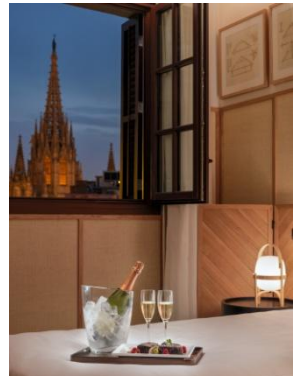
Classic Cathedral: Rooms located on the corner of the hotel with views of the cathedral. They are 22 m<sup>2</sup> and can accommodate up to 2 people.