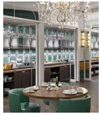
THE AVENUE RESTAURANT & COCKTAIL BAR