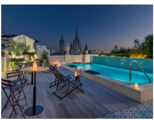
PLUNGE POOL – TERRASSA DEL GÒTIC

It's the perfect outdoor spot to enjoy a delicious cocktail and signature tapas in spring and summer.