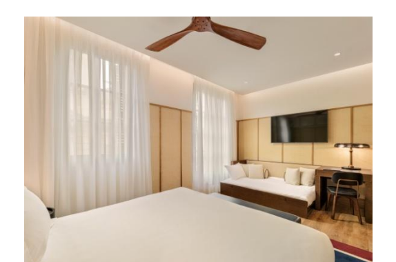
Classic Barcelona Triples: Spacious 22 m<sup>2</sup> rooms with views of the city. They feature a sofa bed and can accommodate up to 3 adults or 2 adults + 2 children.